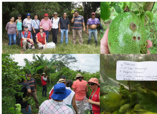
Visited grower farms to collect samples of diseased plants for the hands-on portion of the workshop.