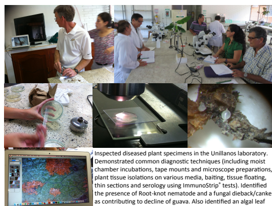
Inspected diseased plant specimens in the Unillanos laboratory. Demonstrated common diagnostic techniques (including moist chamber incubations, tape mounts and microscope preparations, plant tissue isolations on various media, baiting, tissue floating, thin sections and serology using ImmunoStrip® tests). Identified the presence of Root-knot nematode and a fungal dieback/canker as contributing to decline of guava. Also identified an algal leaf disease on this crop.

Visited Fedearroz (Colombian rice growers association) phytosanitary and molecular biology laboratory. This team of diagnosticians and their facilities are ISO90001 certified for quality assurance. We also visited the research facilities of Corpoica (the Colombian corporation for agricultural research).