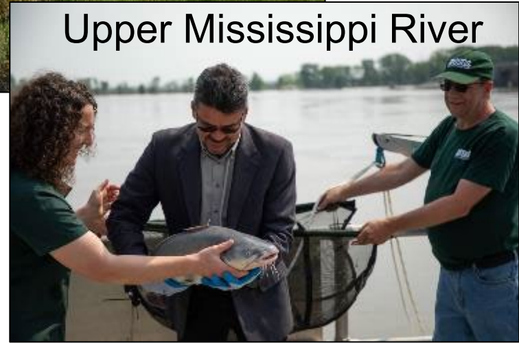
Upper Mississippi River