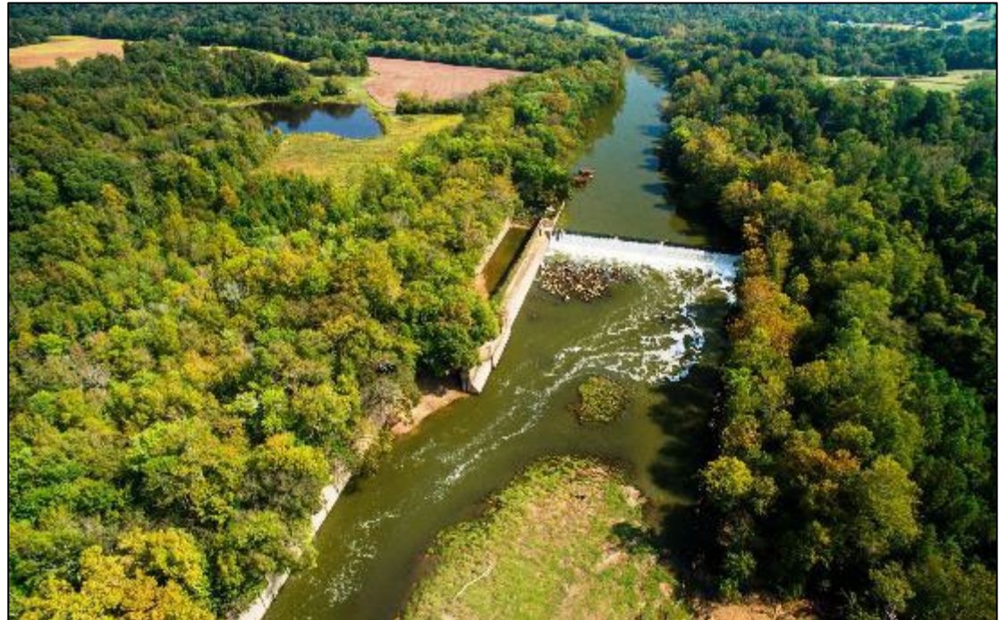
Green River in Kentucky