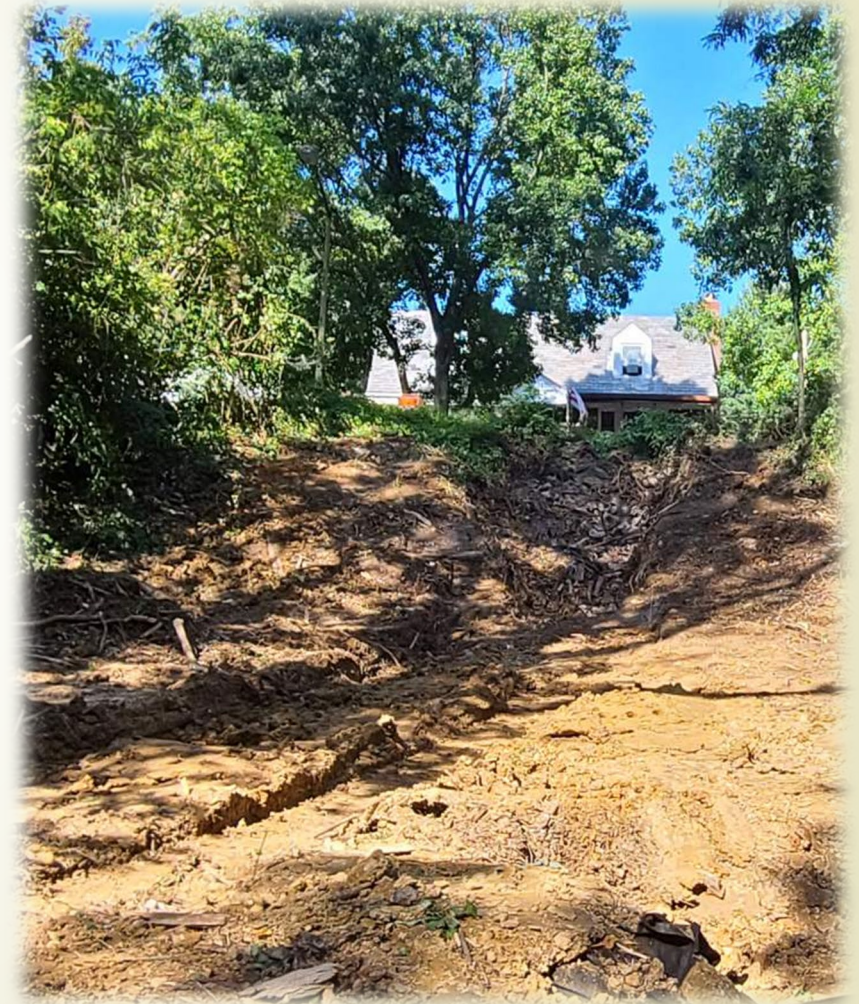
Actively eroding gully