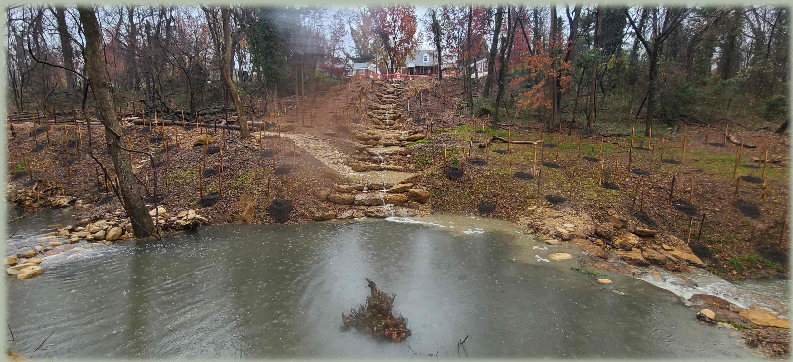
December 2020 (Demobilization Week)