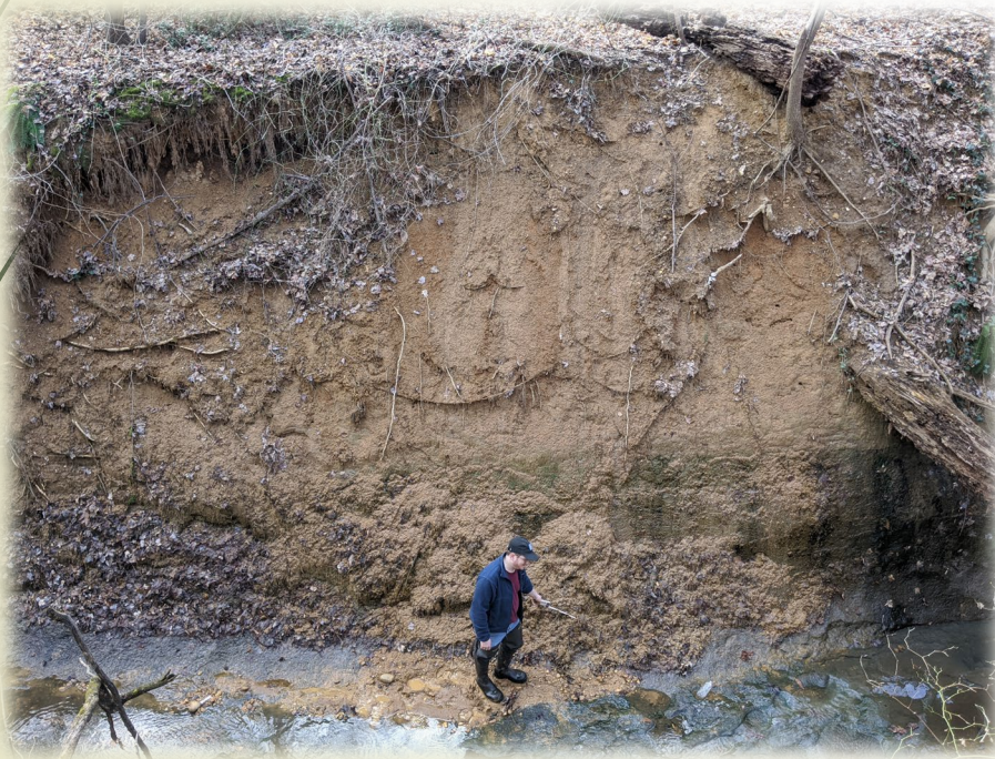
16-ft V shaped channel