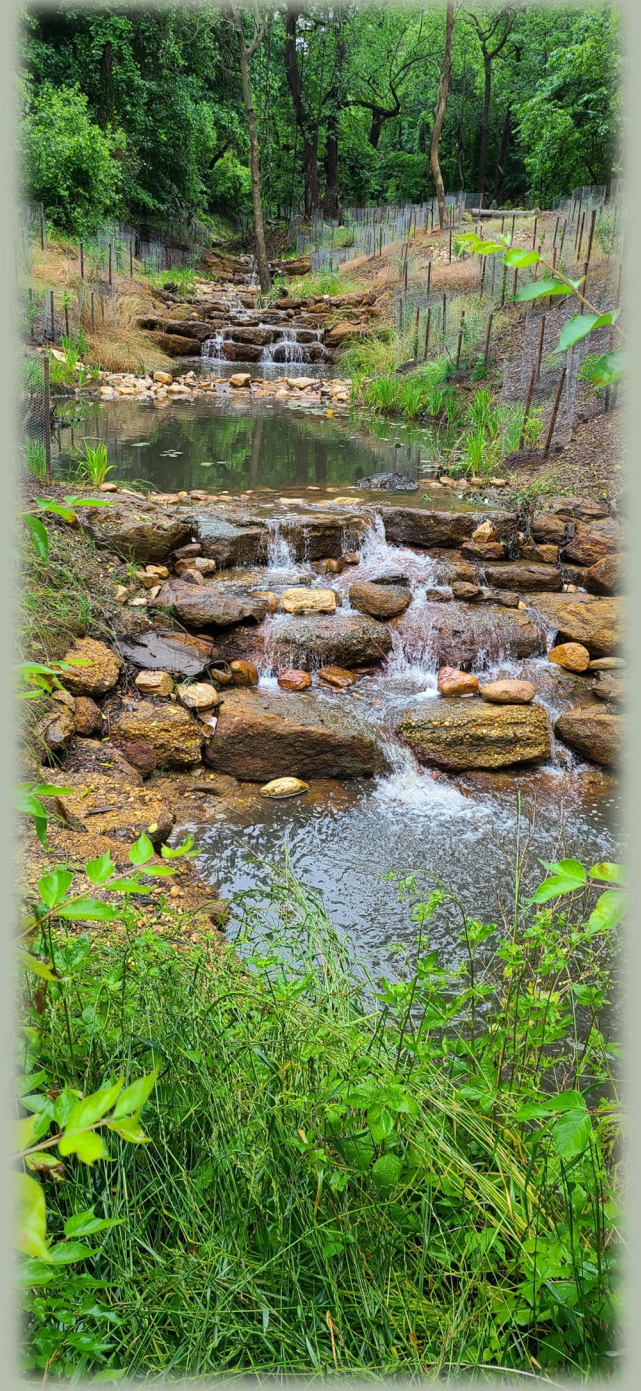
June 2021 First Growing Season