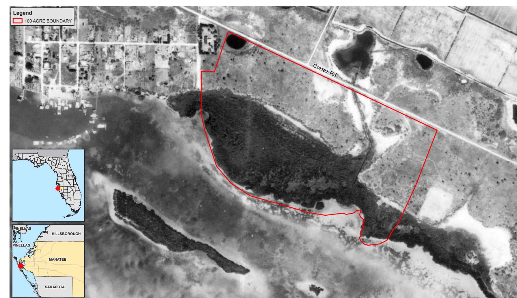
1940's Historical Aerial of the FISH Preserve

F.I.S.H., a local not-for-profit organization, is committed to preserve the character and heritage of Florida's traditional waterfront communities within the natural environment that nurtured people in fishing cultures for thousands of years. They have been awarded additional grants from the Florida Fish and Wildlife Commission.