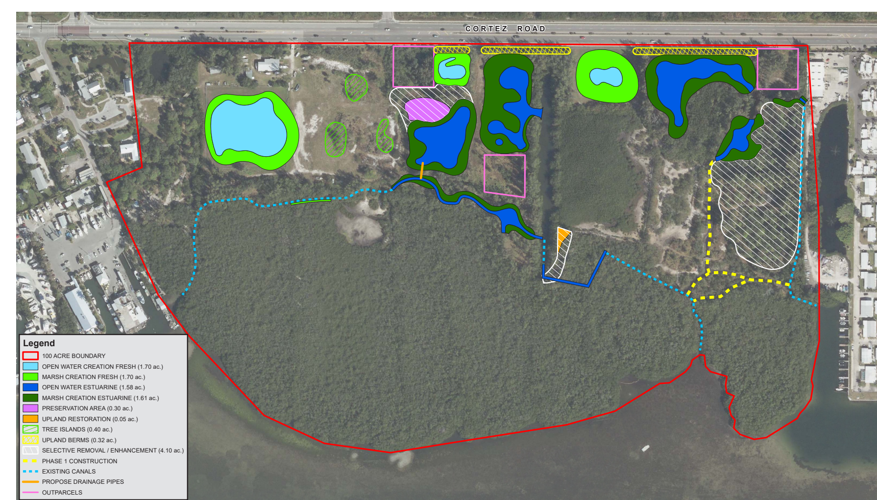
FISH Preserve Concept Plan