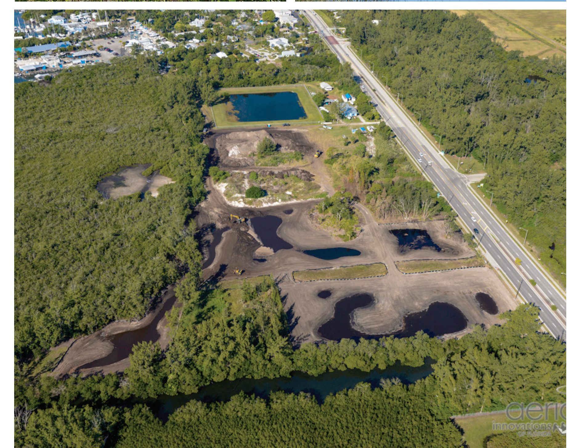
Aerial of Recent Restoration