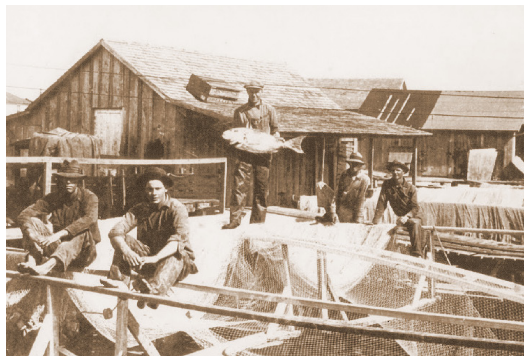
Historical photo of the Cortez Fishing Village

Cortez Fishing Village is one of the last of its kind in Florida. Located an hour south of Tampa on Sarasota Bay, this small, timeless community truly embraces its maritime heritage and the need to protect and enhance native habitat. Because of its strong linkage of Community/Place/Occupation, the residents of the historic Cortez Fishing Village have long memories and a world view that is ecologically centered on the water that surrounds them. Despite the lack of restoration funding available, the fishermen (and women) hosts the Cortez Seafood Festival to raise funds and successfully leverage their monies to obtain grants for large scale habitat restoration.