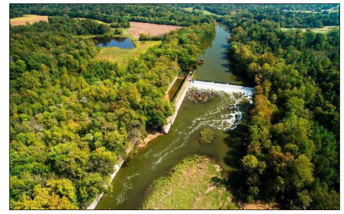
Green River in Kentucky

45 river systems to improve aquatic and wetland habitat on over 12,000 river miles