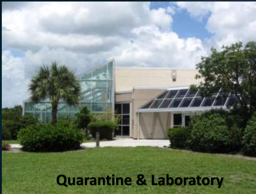
Quarantine & Laboratory