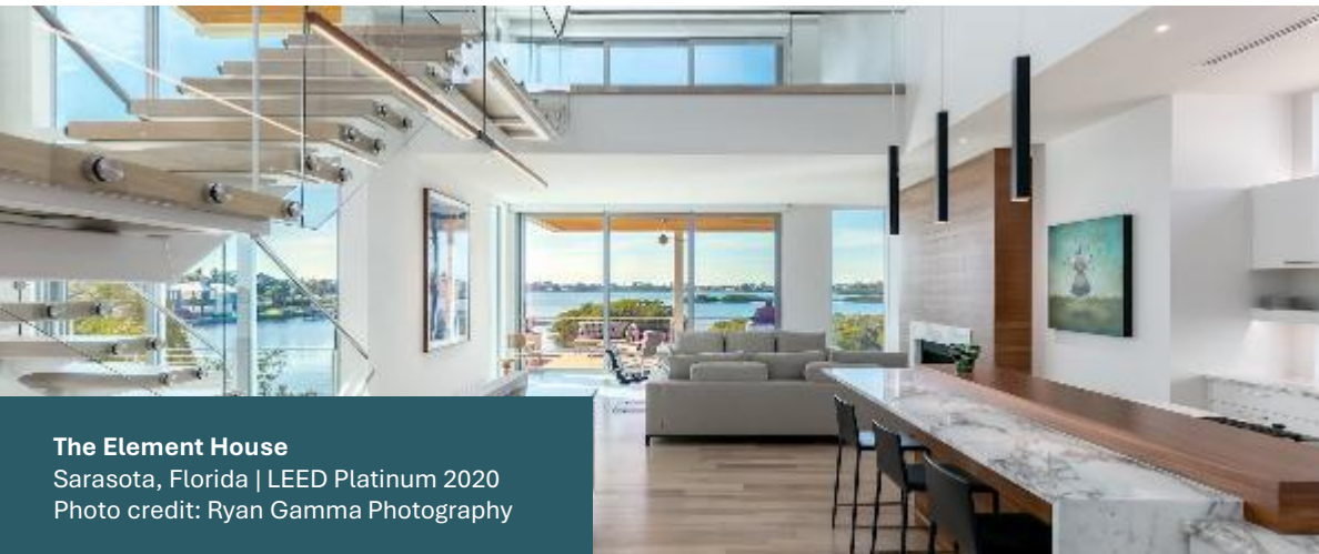
The Element House Sarasota, Florida | LEED Platinum 2020