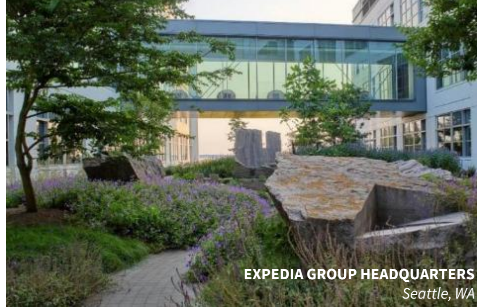
EXPEDIA GROUP HEADQUARTERS Seattle, WA