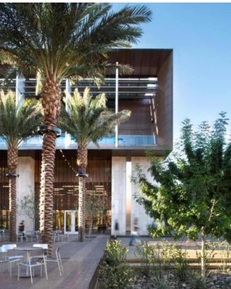
ORANGE MALL RENOVATION Arizona State University, Tempe, AZ