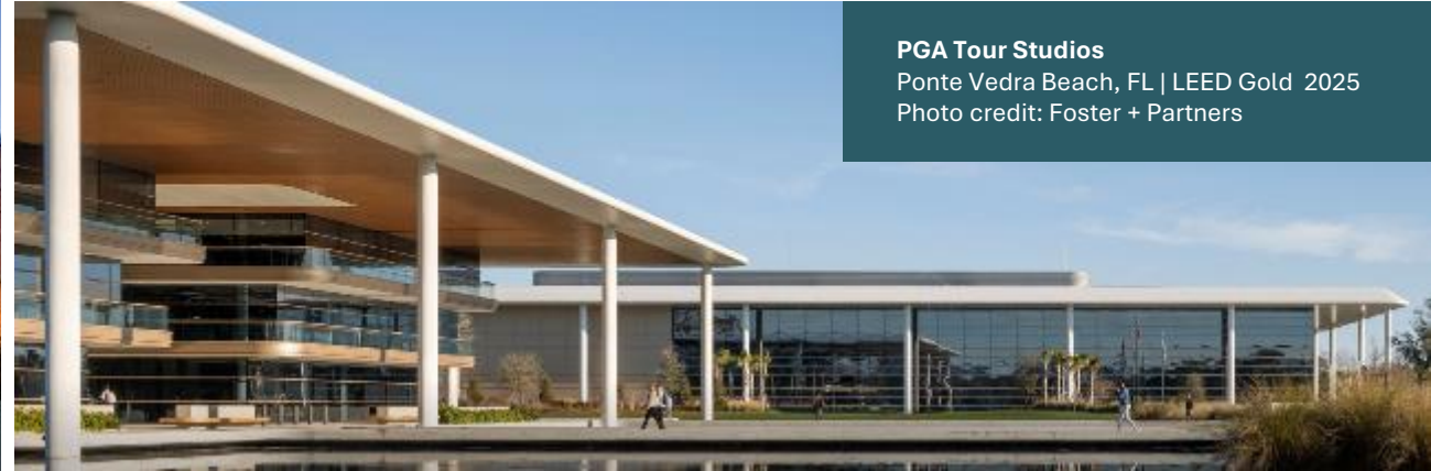
PGA Tour Studios Ponte Vedra Beach, FL | LEED Gold 2025 Photo credit: Foster + Partners