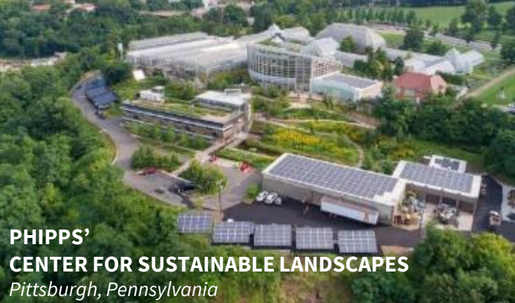
PHIPPS' CENTER FOR SUSTAINABLE LANDSCAPES Pittsburgh, Pennsylvania