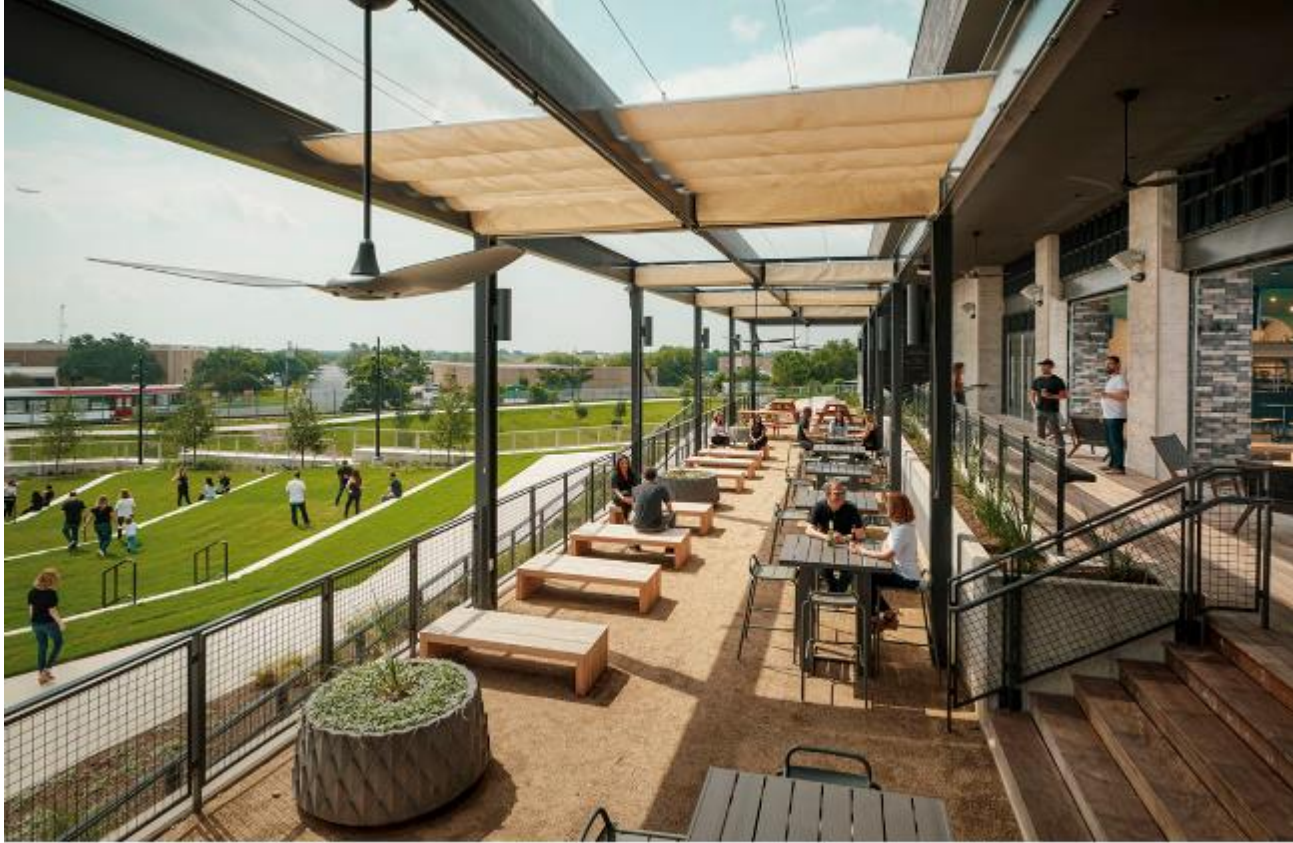
The stadium maximizes opportunities for shade and air flow.