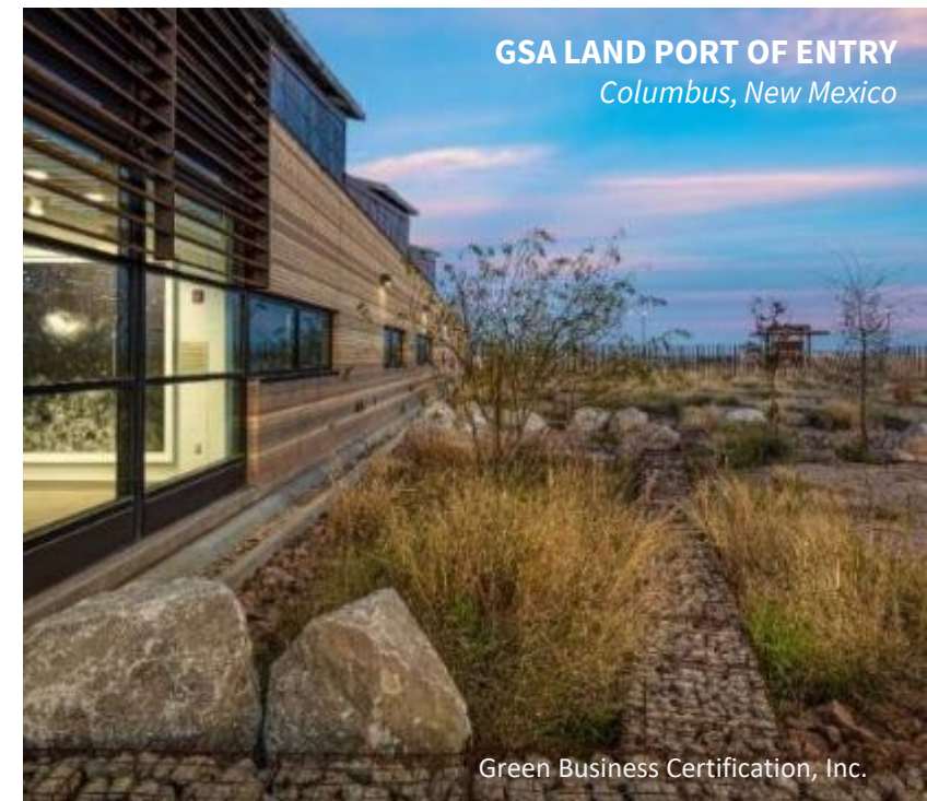
GSA LAND PORT OF ENTRY Columbus, New Mexico