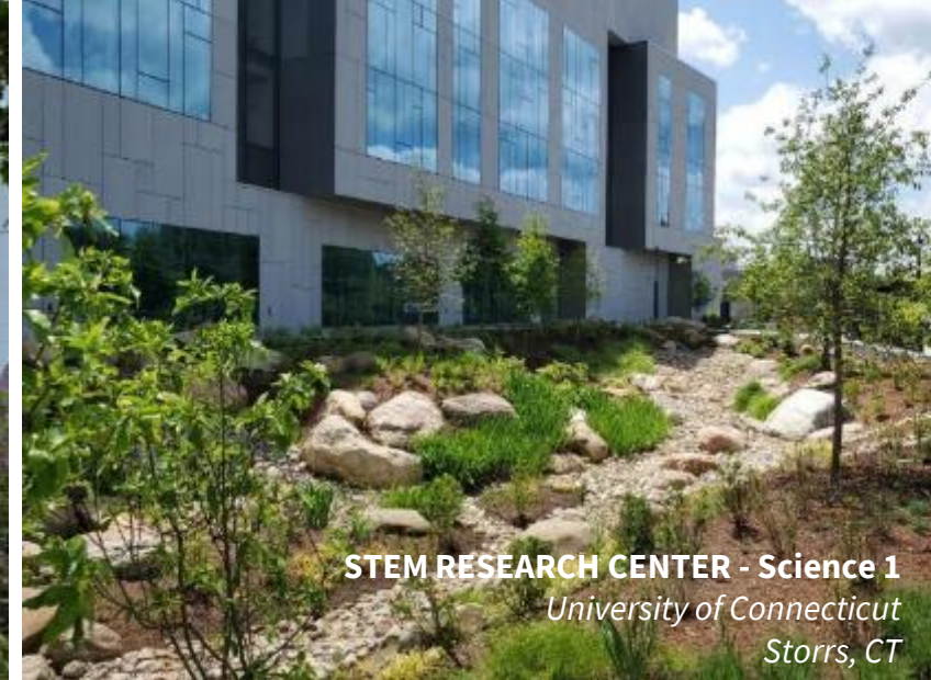
STEM RESEARCH CENTER - Science 1 University of Connecticut Storrs, CT