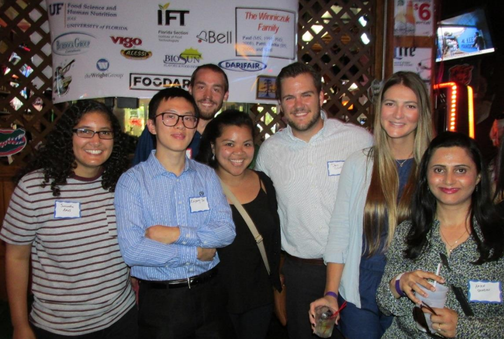
IFT Expo, Chicago