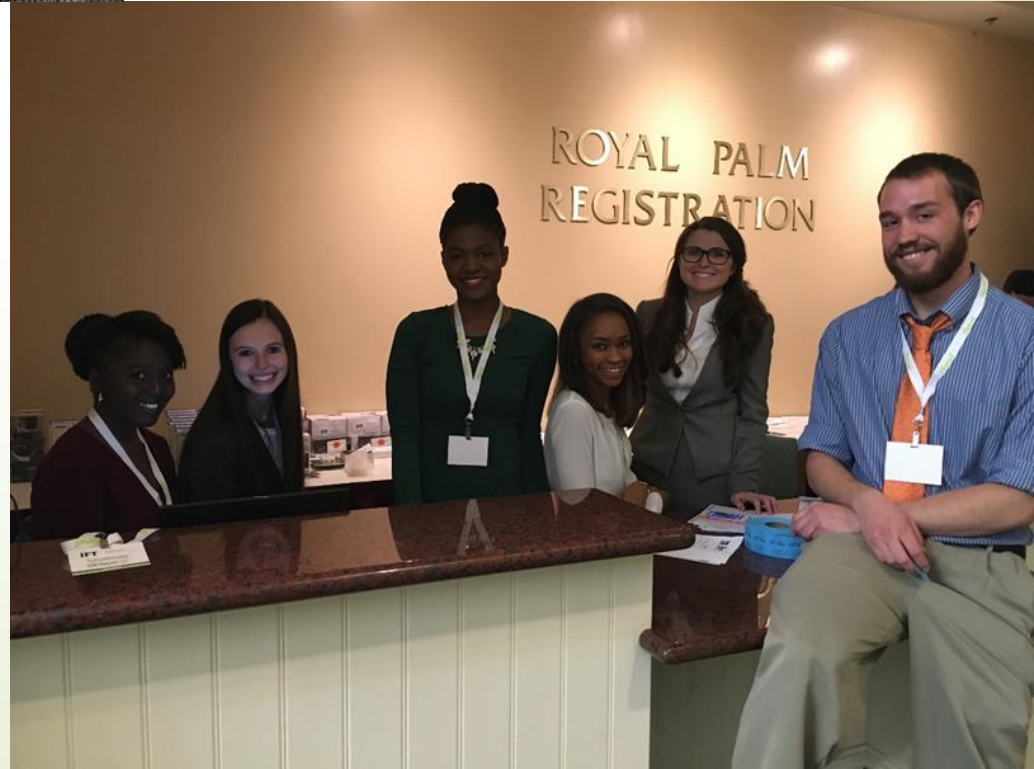
FL Section IFT Suppliers Night