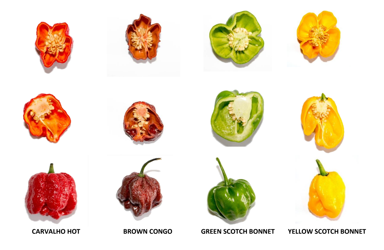
Plate 1. Colors of fresh Caribbean hot peppers pericarp used to develop standard color code.