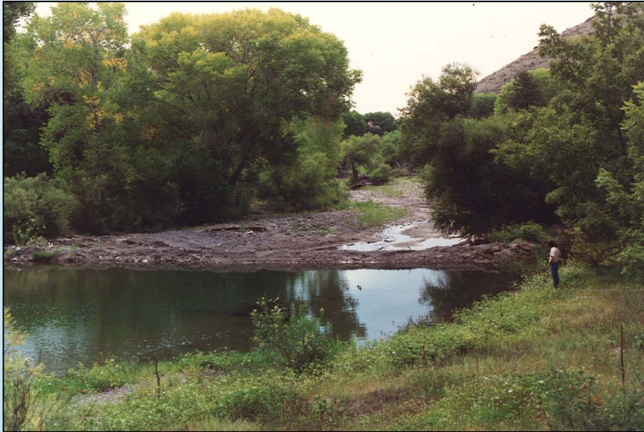
SAPILLO CREEK BELOW LAKE ROBERTS DAM, GILA, NM