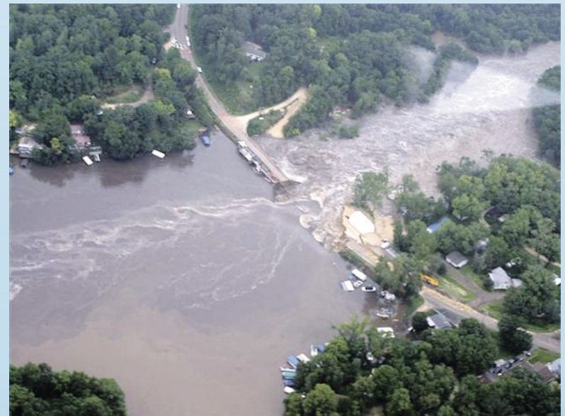
Lake Delhi Dam break