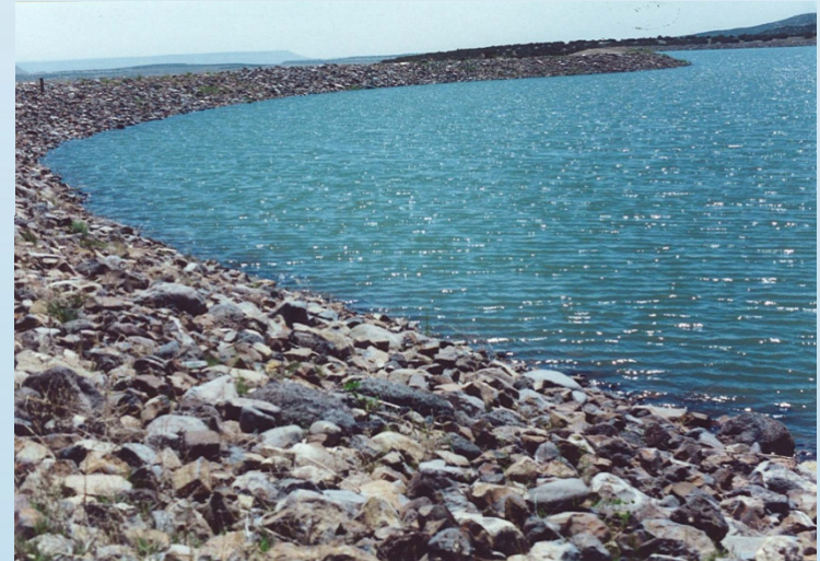
Farmington Lake, NM - water storage and quality