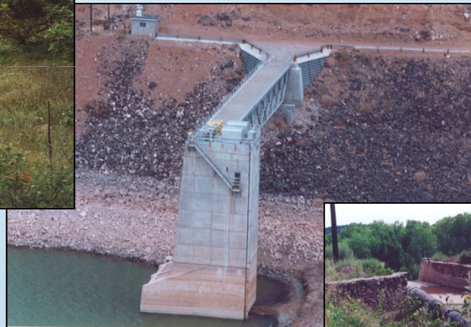
JEMEZ DAM, SANTA ANA PUEBLO, NM