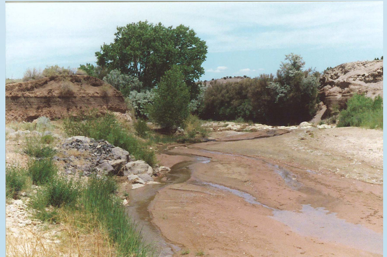
Galisteo Creek, New Mexico