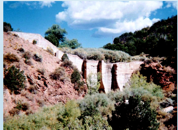
Hondo Arroyo Dam built in 1900's is silted to the top, Santa Fe, NM