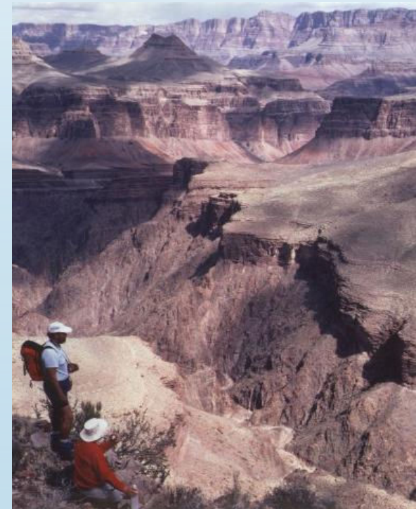
Grand Canyon, AZ