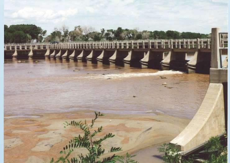
Isleta Dam on Rio Grande, Albuquerque, NM