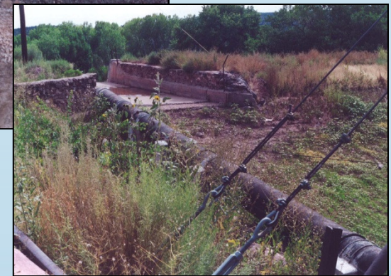
PONDEROSA DAM, PONDEROSA, NM