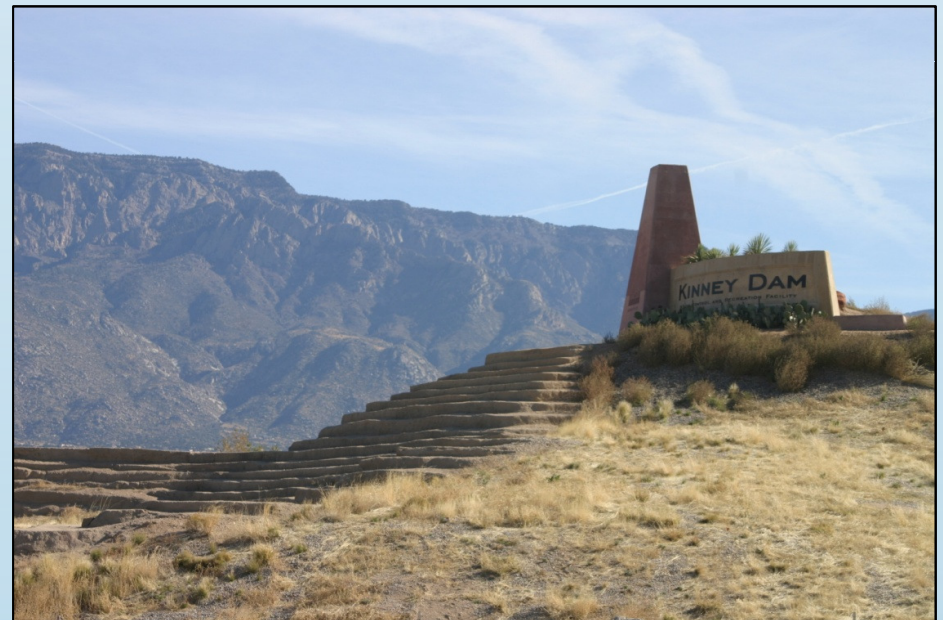
KINNEY DAM, ALBUQUERQUE, NM