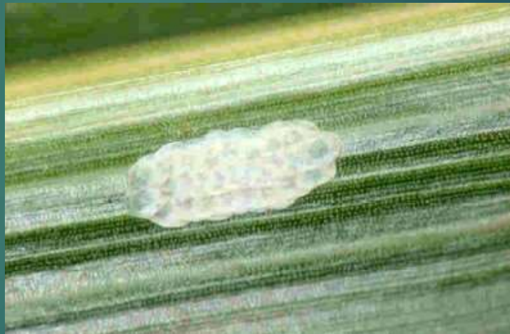
European corn borer