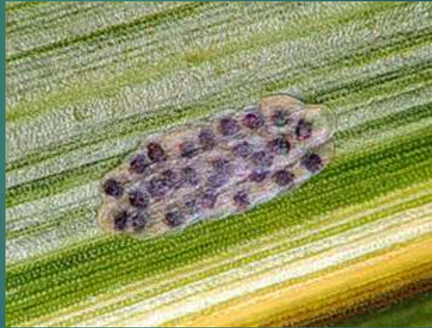
European corn borer